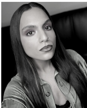
MAKEUP ARTIST & TREND SPECIALIST

Residing in the Bronx, she services our NY and CT clients.