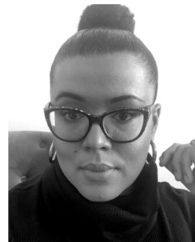
MAKEUP ARTIST & COMPLEXION SPECIALIST

Residing near Camden, she services our central Jersey and Philly clients.