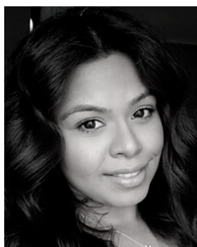
MAKEUP ARTIST & INDIAN WEDDING SPECIALIST