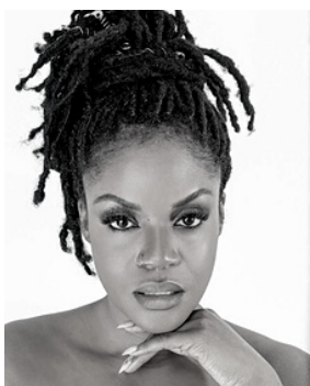
MAKEUP ARTIST & ADDITIONAL HAIR SPECIALIST

We are so lucky to have a group of women who can do BOTH hair and makeup, with just the amount of experience as the rest of our team!