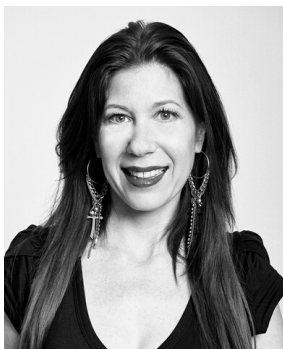
MATURE MAKEUP SPECIALIST & SPRAY TANNER

Our senior hair stylists each have over 15 years of experience styling hair. We pride ourselves in their expertise, talent, and creativity. They'll work with the bride and bridal party so everyone is getting the taste of our luxurious, hair masters.